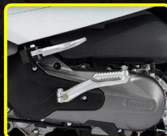
124CC, SINGLE CYLINDER, 4-STROKE, 2 VALVES, SOHC