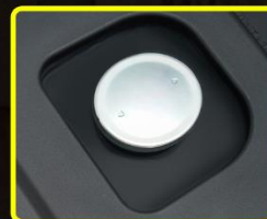
FUEL TANK 4.6-LITRE