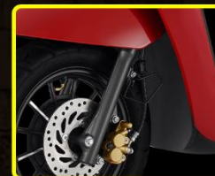
TELESCOPIC FRONT FORK