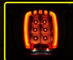
STYLISH LED TAIL LIGHTS