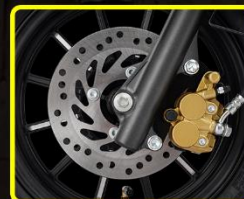
190MM - FRONT DISC BRAKES