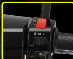
ENGINE KILL SWITCH