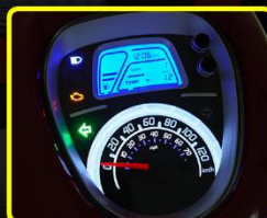
DIGITAL AND ANALOG SPEEDOMETER