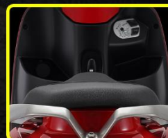
DUAL FRONT STORAGE POCKETS WITH USB PORT