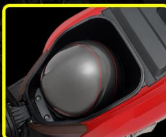
STORAGE COMPARTMENT 12-LITRE